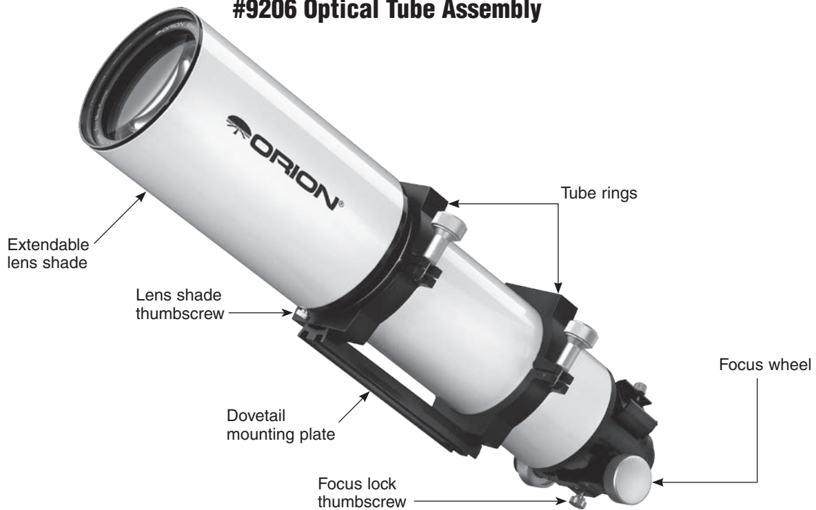
Figure 1. The Premium 110mm f/7.0 ED Refractor optical tube assembly

Congratulations on your purchase of an Orion Premium 110mm f/7.0 ED refractor optical tube. Your telescope has been designed with high quality optics and excellent mechanical construction. The ED glass in the objective lens means you'll enjoy images with far less chromatic aberration than those seen in a standard refractor, and the smooth dual-speed Crayford focuser will make getting sharp images a breeze. These instructions will help you set up and use your telescope.